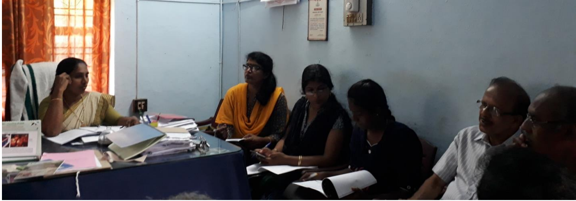
Visit to flood affected areas